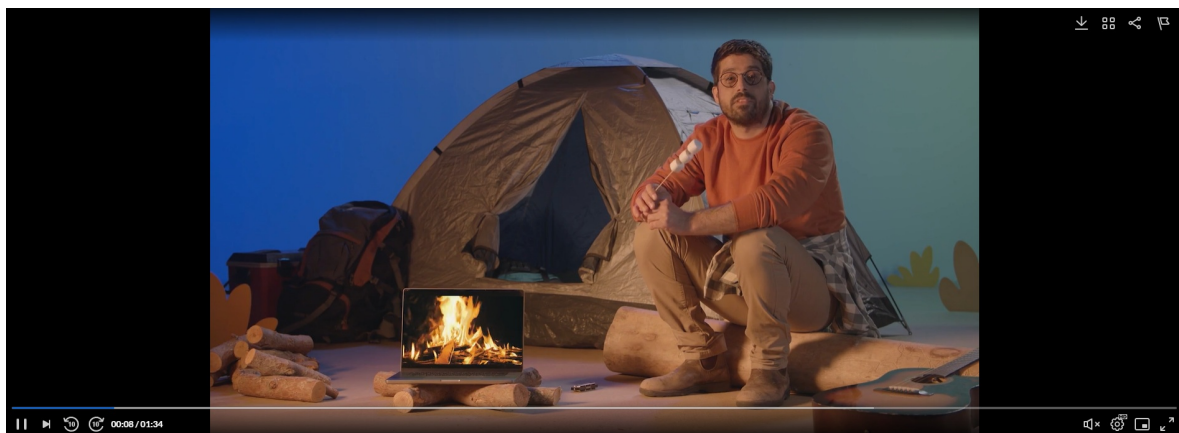
A fireside chat