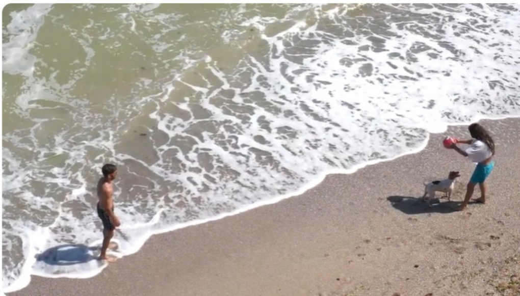
Dog at beach