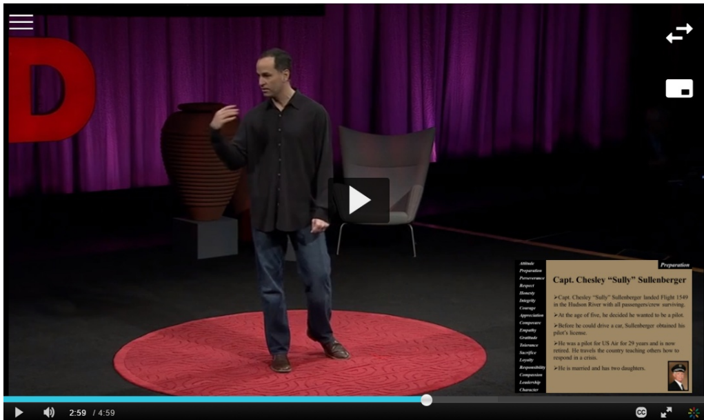
Picture in Picture