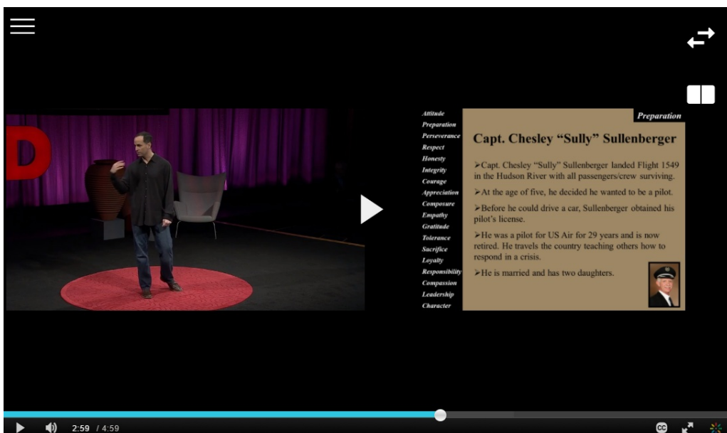
Side by Side